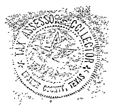
Tax Assessor-Collector Upshur County, Texas